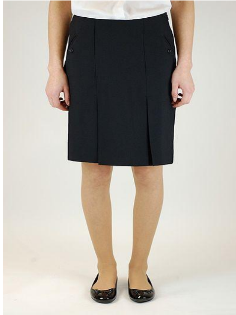
Figure 02: Inverted Pleat