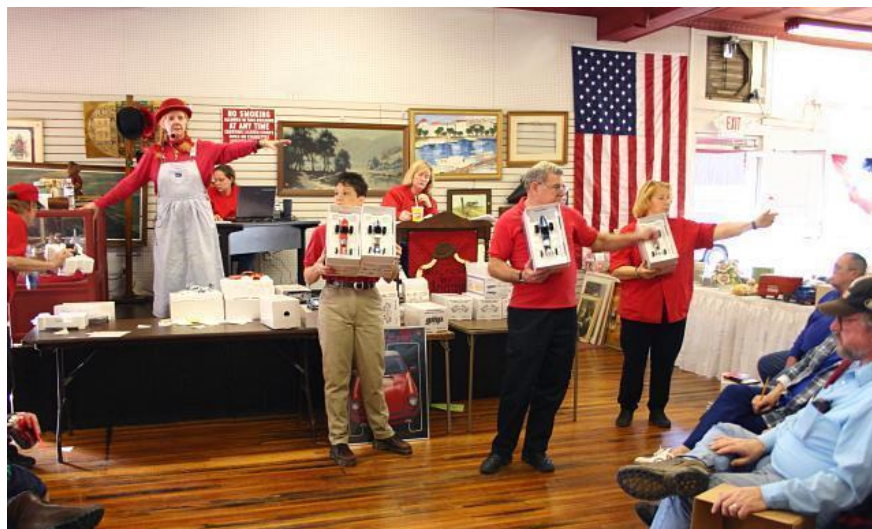
Figure 01: Auction

E.g. The highest price ever paid for a painting at an auction is $179.4 million in 1995, which was for the painting Les femmes d'Alger, an artwork of Pablo Picasso.