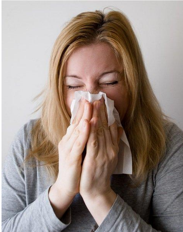
Figure 02: Walking Pneumonia is less severe than Pneumonia