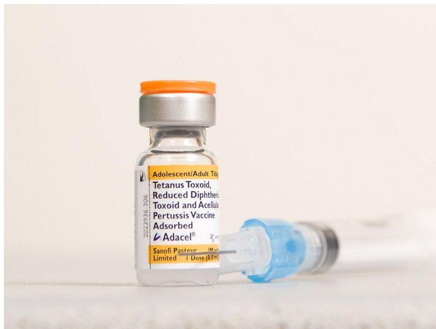
Figure 02: Tetanus Toxoid Vaccine

Toxoid vaccines are safe since the virulence cannot be reversed after inactivation. They are stable and not subjected to denaturation by environmental conditions. Tetanus toxoid and diphtheria toxoid are two toxoid vaccines successfully developed by scientists.