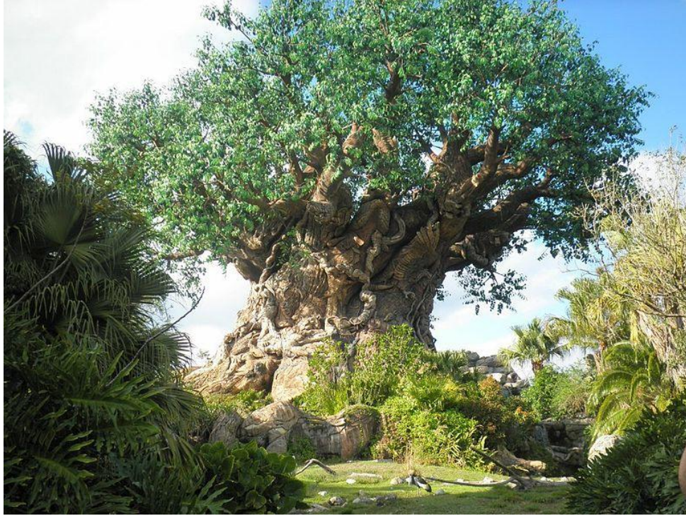
Figure 04: Tree of Life

Animal Kingdom is divided into seven themed sections: Oasis, Discovery Island, Africa, Asia, DionLand USA, and Pandor – the World of Avatar. Oasis serves as the park's main street and connects the world of animals to the outside. Discovery Island, at the center of the park, connects with all other sections of the park. The tree of life is located at the Discovery Island.