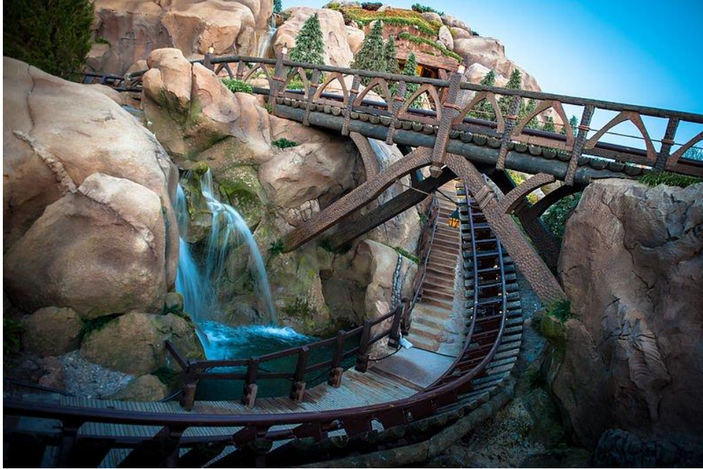
Figure 02: Seven Dwarfs Mine Train

You can also meet a variety of characters such as Peter Pan, Mickey Mouse, Alice, Cinderella, Rapunzel, Snow White, Mary Poppins and Aladdin in this theme park. Magic Kingdom also has a selection of restaurants and cafes, providing a unique dining experience. Crystal Palace, Cinderella's Royal Palace, Be Our Guest, Casey's Corner, Cosmic Ray's, and Gaston's Tavern are some of these.