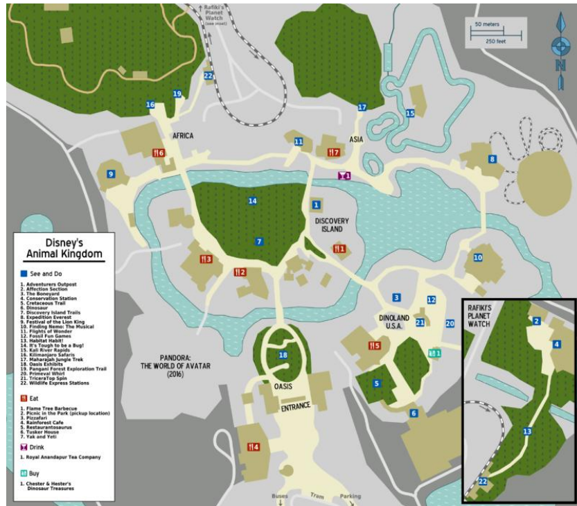
Figure 05: Map of Disney Animal Kingdom