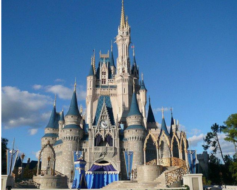
Figure 01: Cinderella Castle