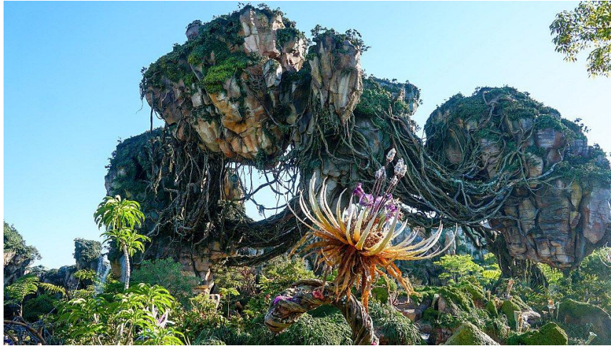
Figure 06: The World of Avatar at Disney's Animal Kingdom

Animal Kingdom is home to about 1700 animals belonging to various species. Some of these animals include hippopotamus, African elephants, crocodiles, lions, deer, giraffes, and rhinoceros.