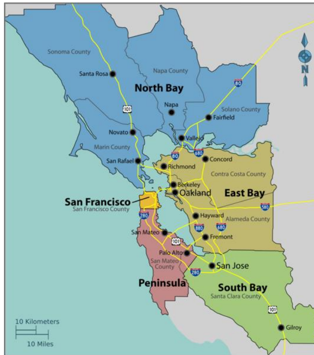
Figure 01: Map of Bay Area

Bay Area has a population of approximately 7.68 million people. This population is ethnically diverse as roughly half the population belong to various ethnicities such as African American , Asian , and Hispanic . This area is famous for its lifestyle, high-tech industry, and liberal politics.