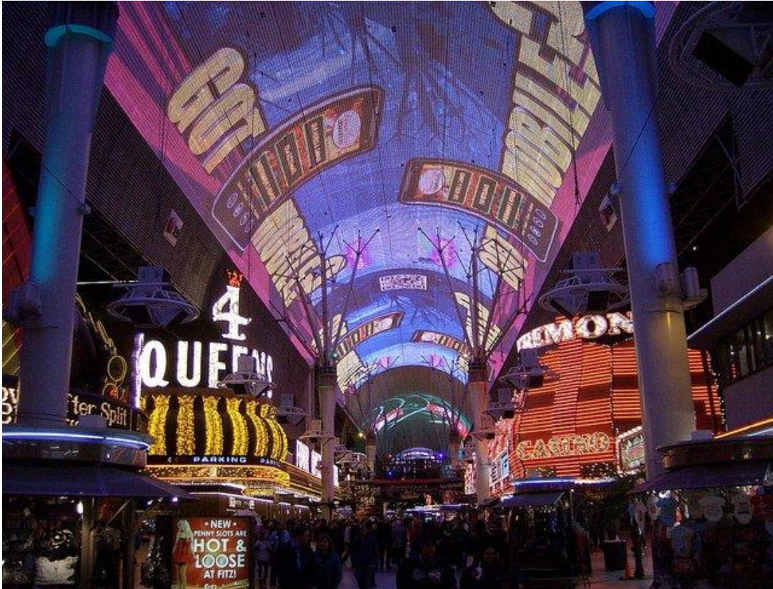
Figure 02: Fremont Street Experience

Fremont Street Experience, a pedestrian mall and attraction that comes to life every night, is found in Fremont Street Casino District.