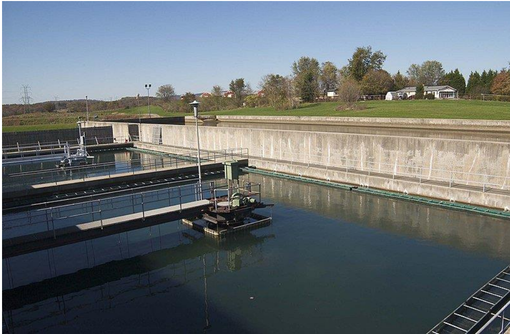
Figure 01: Coagulation in Water Treatment

Once the coagulants are added and the charges of the particles are neutralized, it allows the particles to interact with each other and stick together. These joined particles are referred to as microflocs. But these particles are not visible to the naked eye. This step is followed by flocculation.