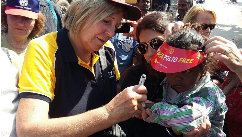
Figure 02: IPV or Inactivated Polio Vaccine

One of the major advantages of using IPV is there is no risk of developing vaccine-derived poliomyelitis. But the immunity induced by IPV is lower than the immunity that is induced by OPV. This is because IPV only produces antibodies that counter the hematogenous spread of the virus without strengthening the mucosal immunity in the intestine. Therefore, the virus can multiply within the GI tract.