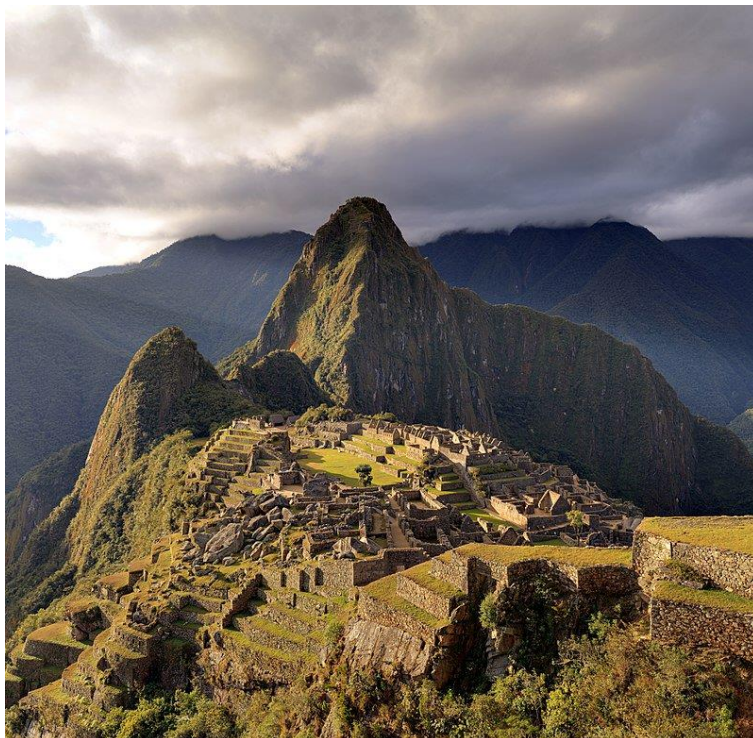
Figure 01: Machu Picchu

Peru is a country with an extreme diversity, made up of a variety of landscapes, including mountains, beaches, deserts as well as rain forests . The most populated area, however, is the coast of the Pacific Ocean, where the capital Lima is located. The Amazon rain forest covers half the country. Peru is also home to several ancient cultures, including the Inca Empire. The famous Inca citadel Machu Picchu is situated in this country.