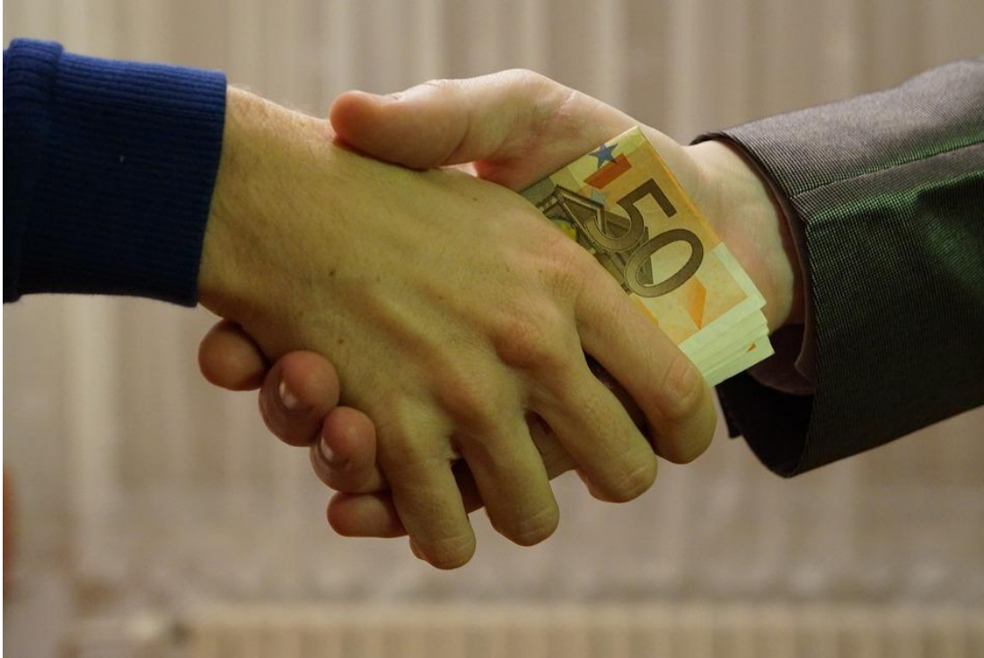
Figure 02: Buying from the black market is a risky business