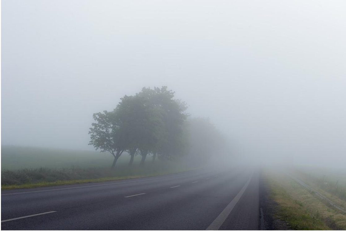
Figure 01: Anyone taking the hillside road is at a risk of confronting the heavy fog in the evening.

Moreover, risk is used in varied phrases such as;