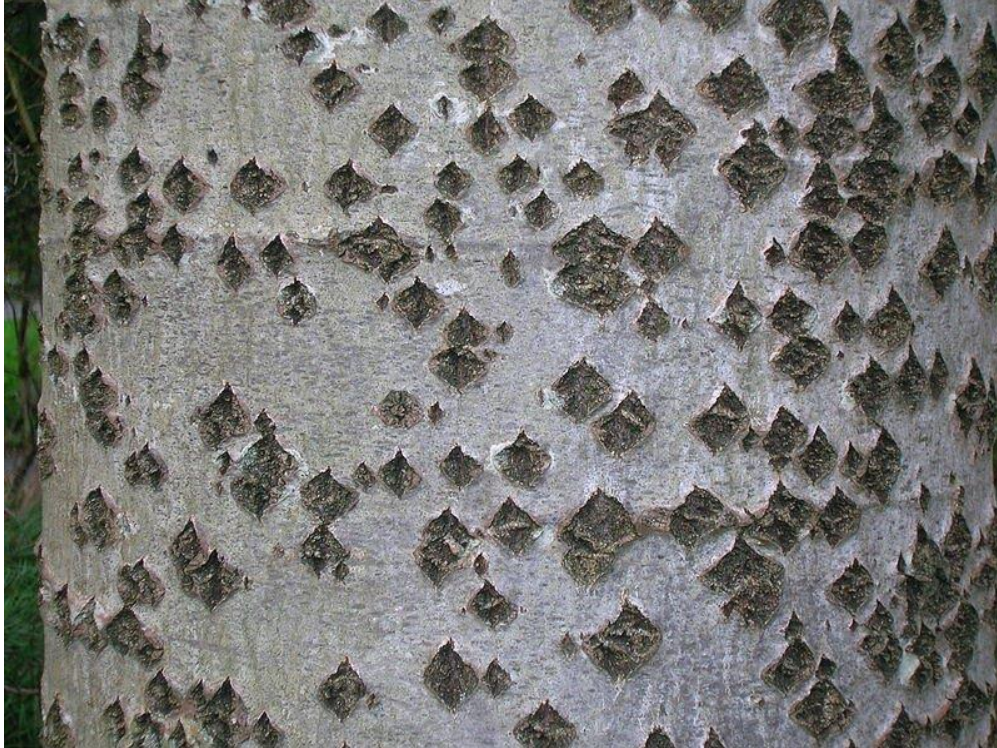
Figure 02: Lenticels

Lenticels sometime can cause fungal infections of the plant due to the exposure of the plant bark all the time to the environment. Lenticels can be found in different varieties of fruits as well such as apples. And also lenticels are present in respiratory roots (pneumatophores roots).