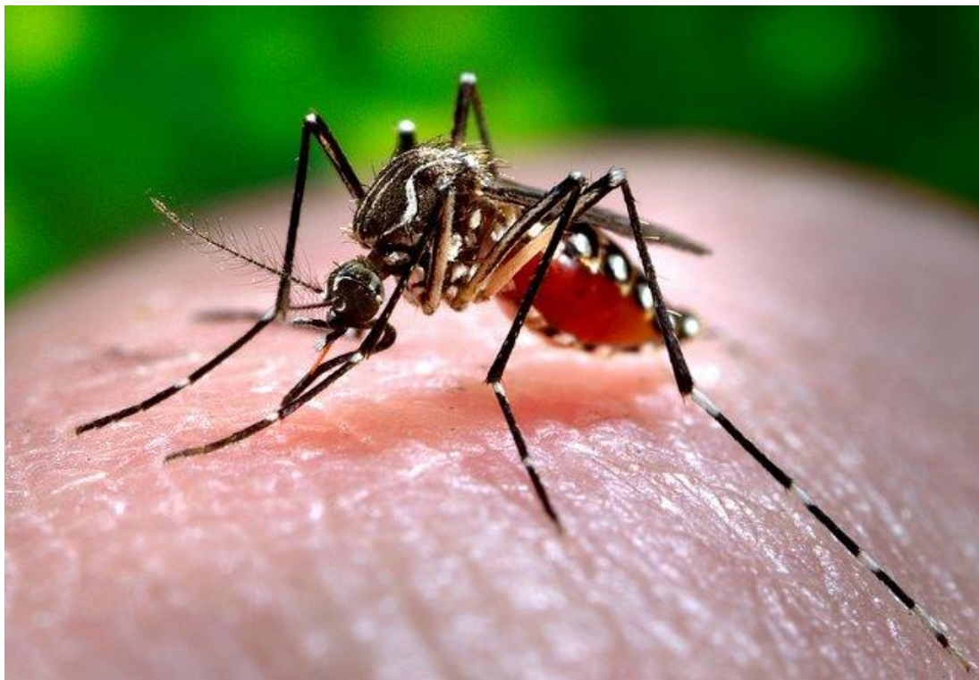
Figure 02: Dengue Mosquito

According to the WHO, vector-borne diseases are accounting for 17 % of the infectious diseases. It is considerable value, and it implies the requirement of the vector control methods to prevent disease transmission since vector-borne diseases affect hundreds of millions of people around the world. Some of the vector-borne diseases are malaria, chikungunya, dengue, schistosomiasis, African human trypanosomiasis, leishmaniasis, Chagas disease, yellow fever, Japanese encephalitis and onchocerciasis etc.